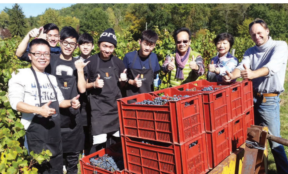
Experience the wine production process in France