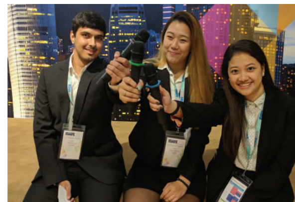
Attend the International Symposium on Advances in Technology Education