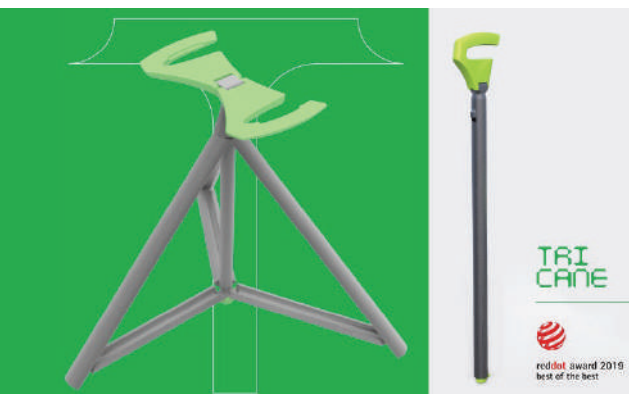
Prizewinning design concept honoured with "Red Dot: Best of the Best" award by HKDI student