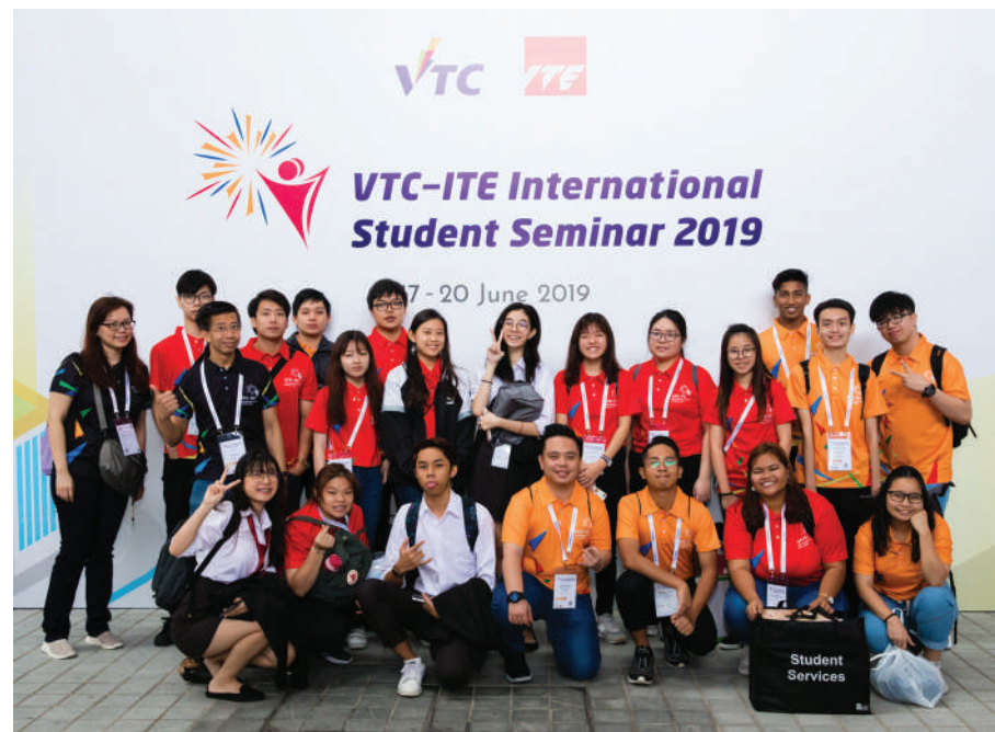
Biennial International Student Seminar jointly organised with the Institute of Technical Education (ITE) of Singapore